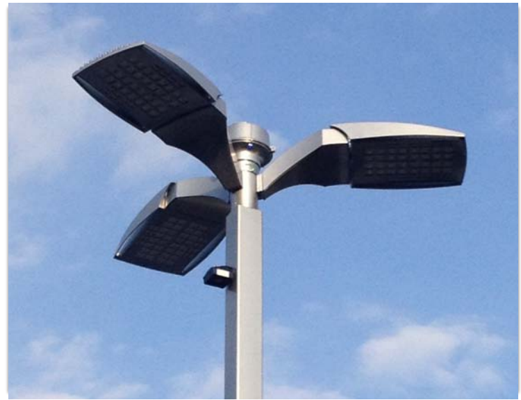
Wireless node atop three-fixture pole with motion sensors.