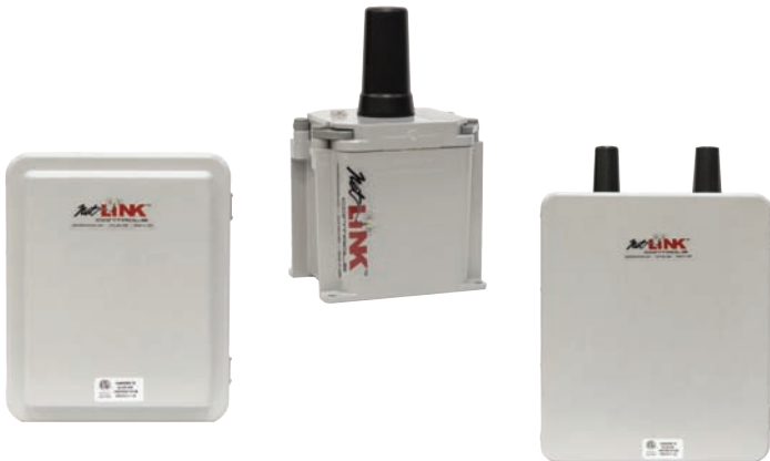
Wireless Nodes and Base Station (right)

With 120-480 VAC power to each node, netLiNK can take control of the electrical system without running any new circuits.